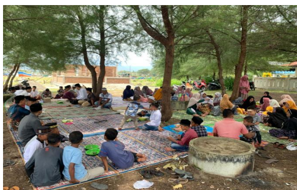
Figure 2. View of Rabu Abeh Ritual in Gampong Lhok Pawoh

After completing the aforementioned activities, the final step in the Rabu Abeh ritual is to descend into the sea or river for a communal bath. A portion of the community, ranging from children to adults, participate together in this bathing ritual. The purpose of the Rabu Abeh bath or Safar bath is to cleanse oneself of sins and illnesses, as well as to remove calamities and disturbances caused by evil spirits from the body and the surrounding environment of the local community. According to reliable sources, the Rabu Abeh bath holds the significance that each drop of water that falls from the body represents the eradication of anything considered to bring misfortune on the day of Rabu Abeh (Amral, 2022).