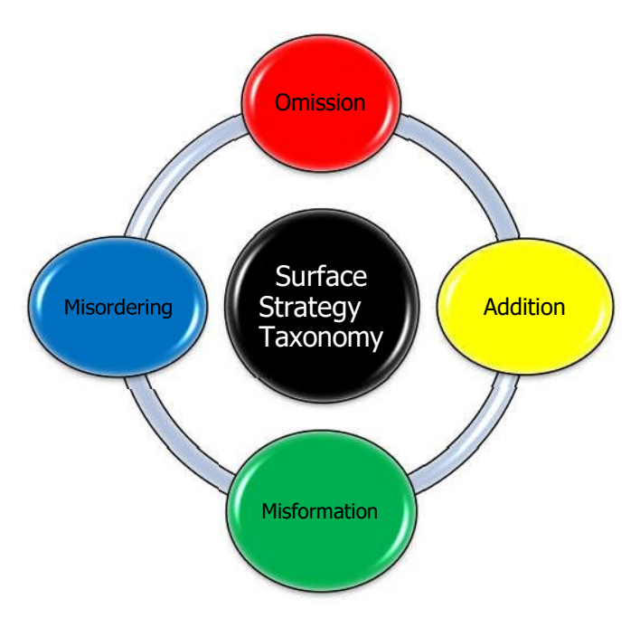
Figure 2: Types of Error in Surface Strategy Taxonomy